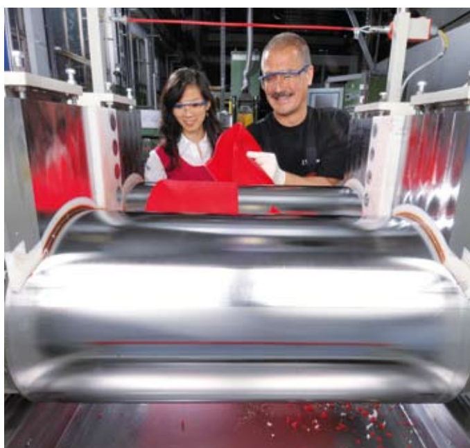
Our expertise: processability tests

Analyzing dynamic and mechanical behavior with the aid of physical models (rouse, reptation, double reptation, etc.) permits quantitative characterization of molecular and mesoscopic properties. This can be applied, for example, to the arrangement and sequence of monomers, to chemical and physical crosslink density, molecular weight, molecular weight distribution, and branch structure.