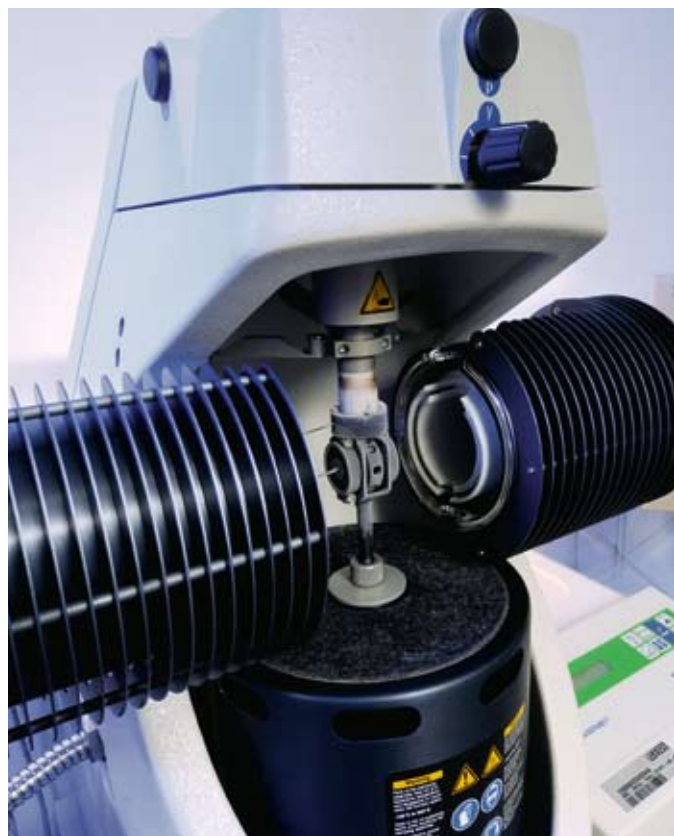
Our expertise: dynamic and mechanical characterization

For the physical evaluation of other non-linear properties such as dynamic crack growth or durability, we offer special measurement methods. For example, we have developed a device called the “tear analyzer” which is available for conducting tests of this type.