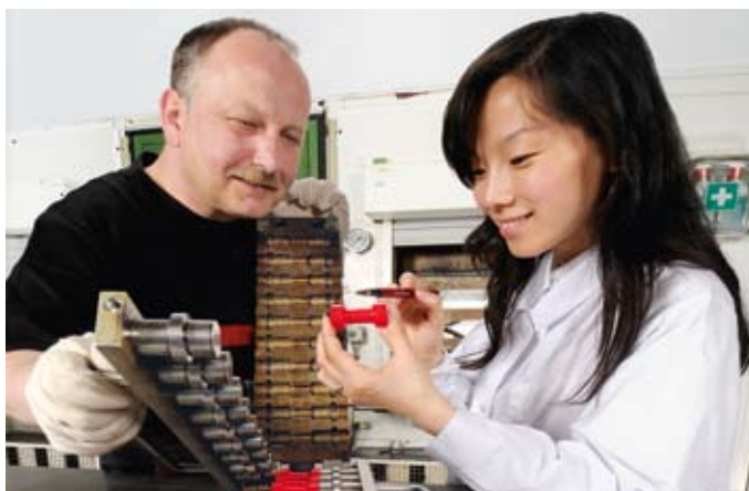
Our expertise: customized tests and test specimens

Based on DIN EN ISO 9001 certification, all our measurements and analyses meet the high international quality standards recognized within the rubber industry and the stringent guidelines of an extremely wide range of industrial consumers.