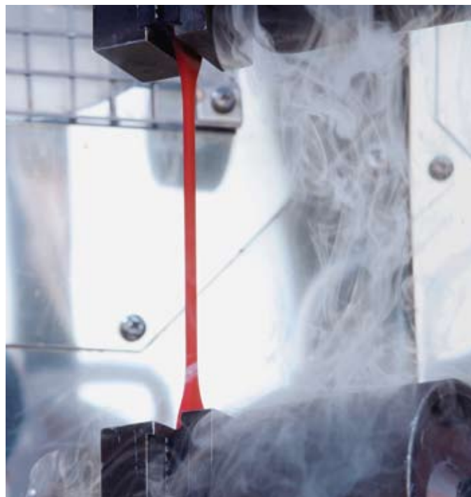
Our expertise: testing rubber, compounds and vulcanizates

Please contact us if there is anything you do not see in our catalog of services. We will be happy to provide you with a detailed individual quotation for special testing or compounding orders that are not included in this overview, as well as for conceptual design and consulting services.